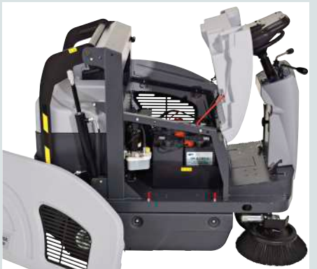
Maintenance is easy since no tools are needed for broom and filter removal and easy access to all components makes maintenance and service fast and easy