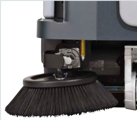
DustGuard™ misting system adds to the dust free sweeping improving the environment for operator as well as the surroundings (optional)