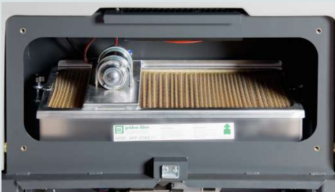
An electrical filter shaking system cleans the filter automatically every 5 minutes