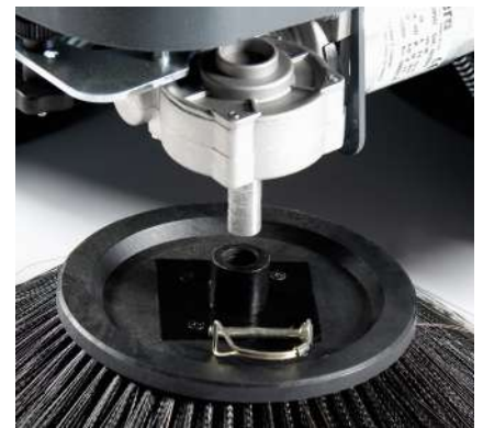
Nilfisk's famous no-tools concept allows fast and easy replacement of brushes and filter for minimal downtime