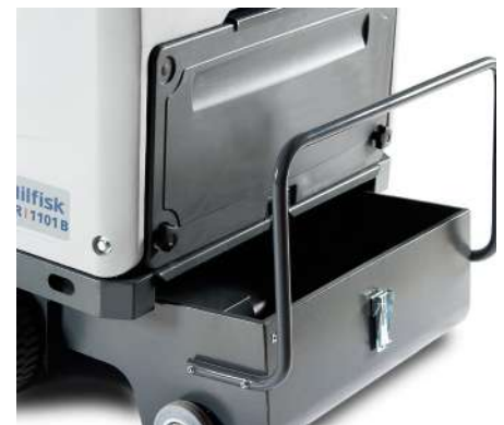
The hopper capacity is extremely large to extend operational time