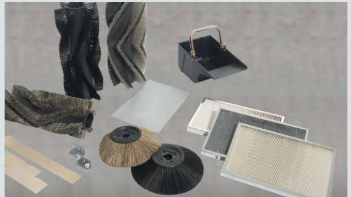
Large range of optional accessories provides the right tools for specific jobs e.g. carpet kit, special filters and brushes, overhead guard, 2x18 litres hopper containers etc.