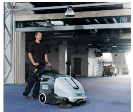
Removes even the smallest particles – also on carpet areas.