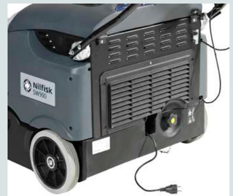
The battery version of Nilfisk SW900, for both in- and outdoor sweeping, has an onboard charger as standard