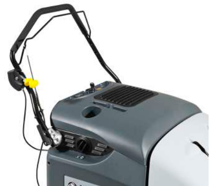
Convenient transport and storage: Handlebar completely foldable.