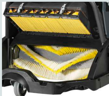
Time-saving maintenance: Broom change, and other maintenance tasks, can be carried out without tools