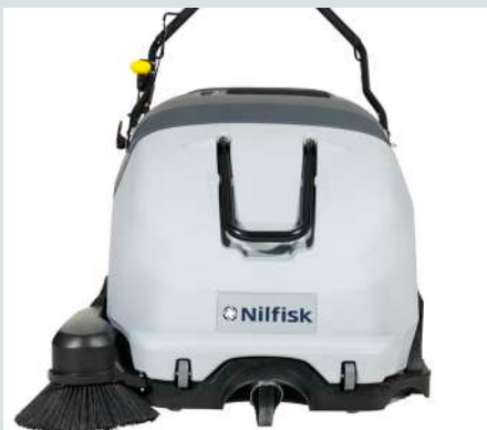
Good hygiene: Hands of user will only touch clean parts of hopper when dumping the debris.