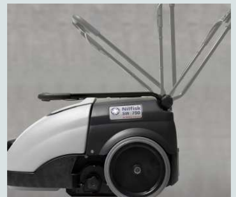
The handle is fully adjustable to suit each individual operator. It folds down completely to simplify storage.