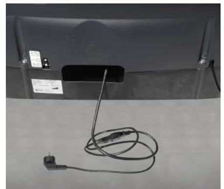
The plug-in onboard battery charger ensures continuous and hassle-free operation.