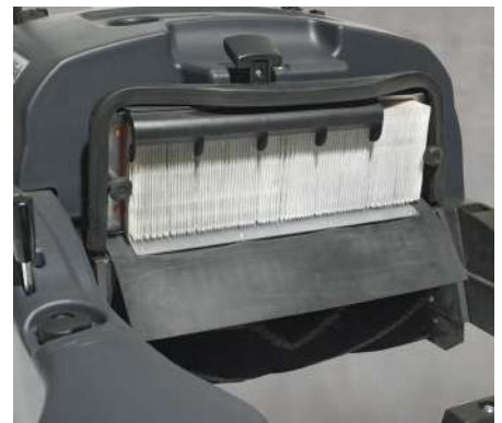
Thanks to the polyester filter the SW 750 can be used in both dry and humid areas.