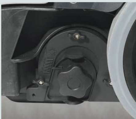
The main and side brushes are adjustable to ensure perfect pressure on the floor at all times and in all conditions.