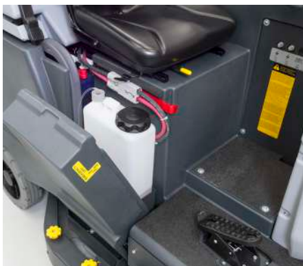
Ecoflex chemical kit (optional): easy accessible detergent cartridges