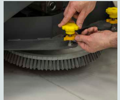
Serviceability: New maintenance free motor, high-quality gearbox and added yellow touch points