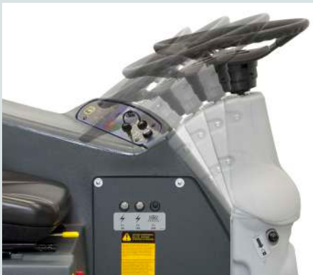
Tilt steering wheel for easy boarding, plus ergonomically designed operator compartment for safety and comfort