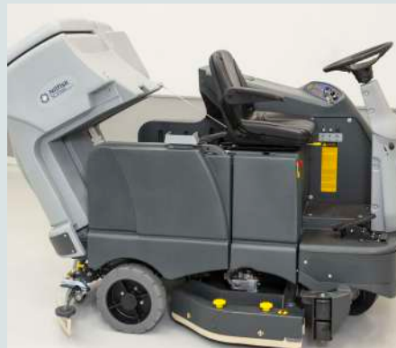
Tip-out and lift-off recovery tank