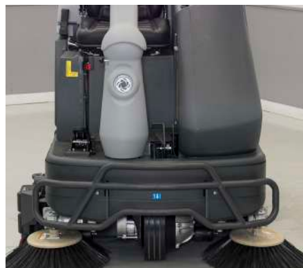
Dual side brooms (cylindrical models) deliver true edge cleaning

The exceptional Ecoflex system allows the operator to match the floor cleaning machine's performance to the soil on the floor and the required level of clean. When encountering more soiled areas of the floor, the operator can activate the "burst of power" button for extra cleaning performance, and as easily return to original settings for minimum usage of water, detergent and power. Green meets clean.